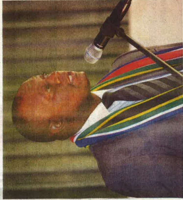
TIPS: MEC Seaparo Sekoati says the youth must study to advance.